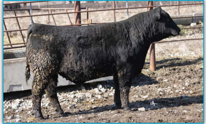
LOT 12 - WHEELER FIREBALL 4013