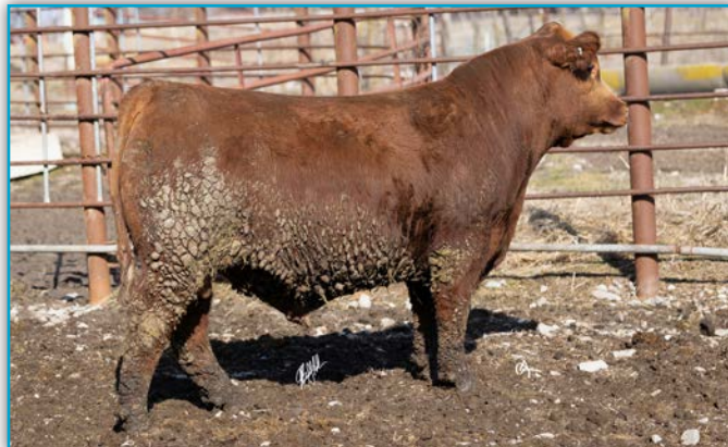
LOT 26 - RFIF PINNACLE 357

Big-bodied, sound and loose-made bull out of MANN Pinnacle. Although our Red Angus offering may be small, we think the quality is very good!