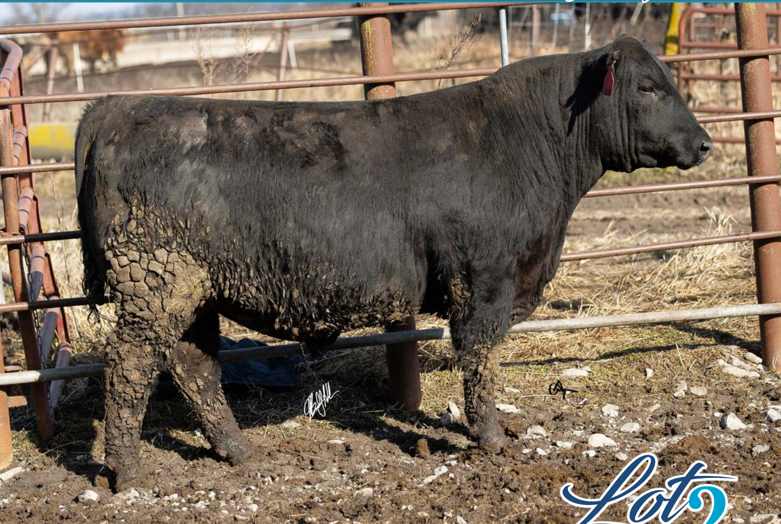
LOT 2 - WHEELER CRAFTSMAN 3228