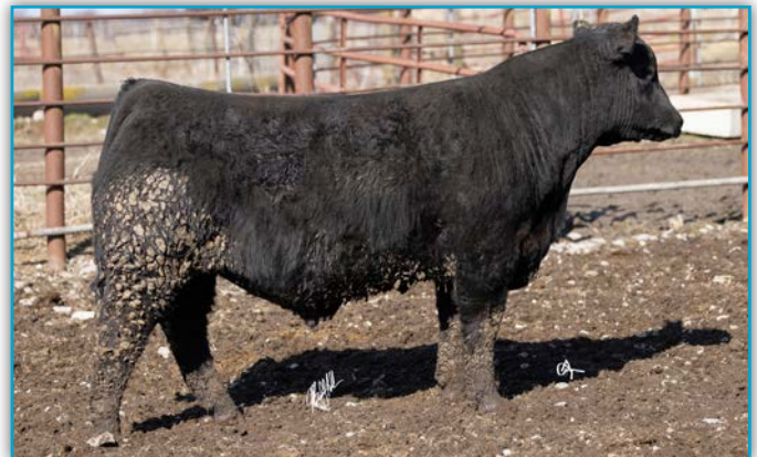
LOT 21 - WHEELER GROWTH FUND 4065