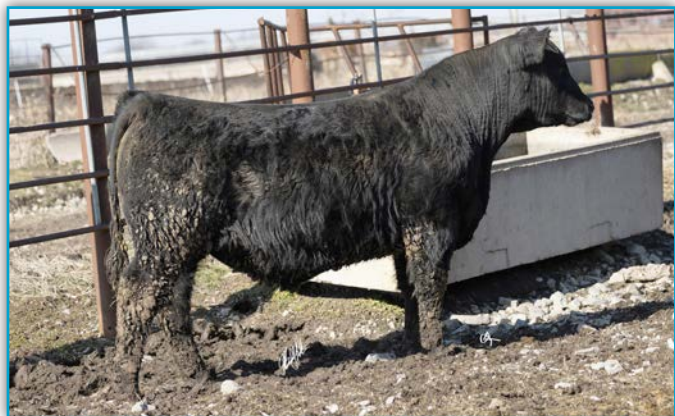
LOT 16 - WHEELER RAWHIDE 4036