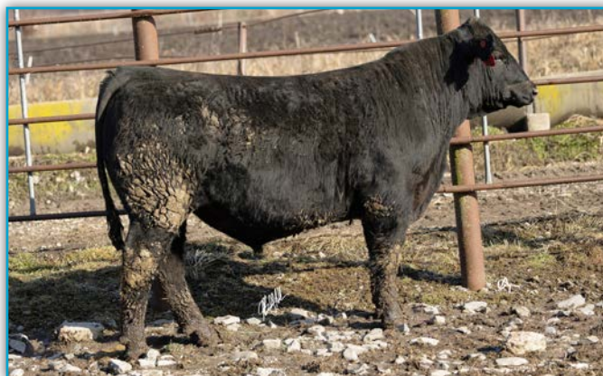
LOT 11 - WHEELER NIAGRA 4029

Ranks in the top 2% for Claw; top 10% for CED.