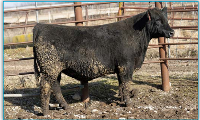
LOT 6 - WHEELER NIAGRA 3226