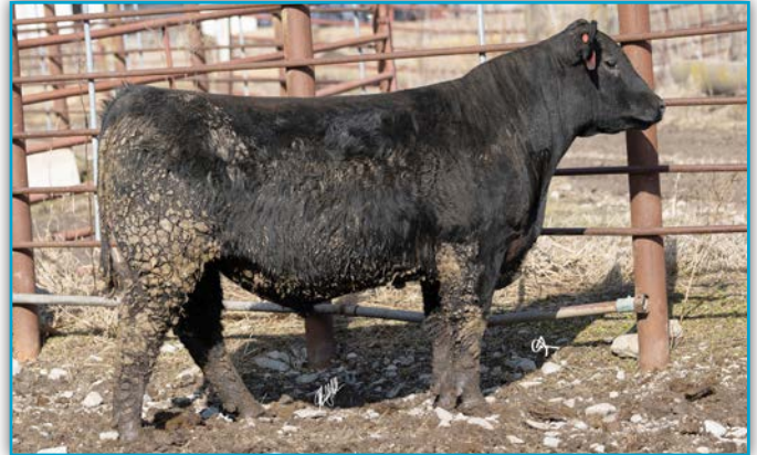
LOT 13 - WHEELER ICONIC 4006