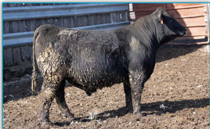
LOT 15 - WHEELER RAWHIDE 4027

We have been really happy with our Rawhide progeny as they have shown to have extra mass and density while still being built with the right feet and legs. 4027 possesses those traits and is still very well balanced on paper, ranking top 10% WW, 25% YW, 20% DOC accompanied by well-balanced $Indexes. Ranks in the top 10% for WW.