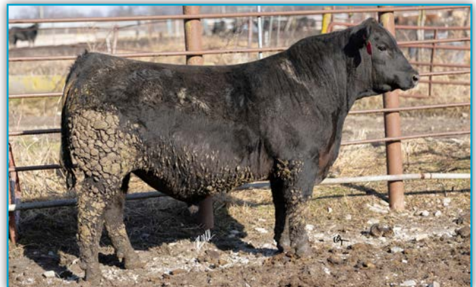
LOT 7 - WHEELER ICONIC 4019

We have been really fond of the DB Iconic progeny that we have raised and this guy is a good testament to that. Stout, rugged and checks all the fundamental boxes, we think 4019 is the cowman's kind. His mother is a daughter of GAR Ashland who boasts exceptional Production and Carcass EPDs with huge $Values.