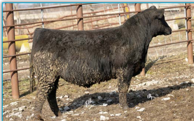
LOT 10 - WHEELER RED ZONE 4041

4041 is a grandson of Conley South Point who is sired by the great Stevenson Turning Point. Although EPD profile is not his strong suit, we feel that 4041 can work well in any program. He is a correct-structured bull who carries plenty of volume and mass. He checks all of the boxes to be a nice herd sire.