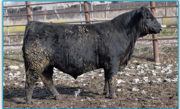
LOT 5 - WHEELER ENHANCE 4001

Sired by a son of the great SydGen Enhance and backed by breed-changing bulls such as KG Justified and LD Capitalist 316, 4001 has a very powerful pedigree. He ranks in the top 20% for Claw and top 10% for Angle. Ranks in the top 10% for Angle.