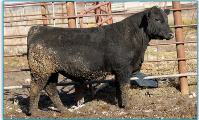
LOT 18 - WHEELER JUSTIFICATION 4034

Ranks in the top 1% for Angle; top 10% for Claw.