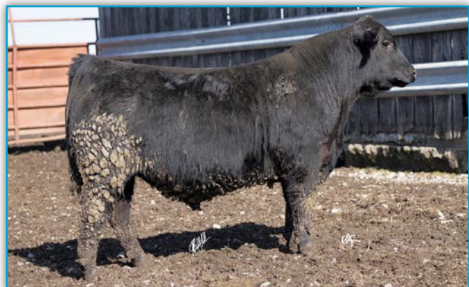
LOT 4 - WHEELER RAWHIDE 4007

When we bred our heifers to Poss Rawhide we had very high hopes for the progeny. When "4007" hit the ground we knew we had something very special. He is one to always catch your eye and show off. Backed by years of performance and pure cow power, we think he is built for the long haul. Possing +14 CED, -2.5 BW, and +13 CEM. Although his numbers are not a slam dunk, his phenotype sure makes up for it. Mark your sale catalog on Lot 4 and come see him and his friends in Kingdom City! Ranks in the top 2% for BW; top 4% for CED.