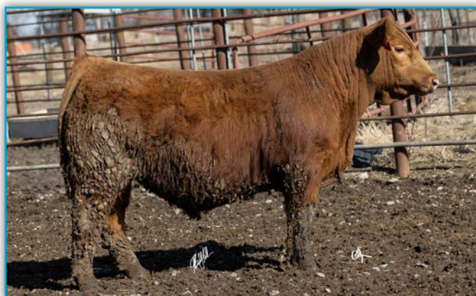
LOT 25 - RCW PROGRESSIVE 4037

Another son out of our Mead Exponential herd sire. Incredible made, big bodied and sound, out of a first calf heifer. Like previously mentioned, we are so proud of the work of our Mead Exponential bull. Even though this bull is technically a commercial, do not let this turn you away on a really good young bull!